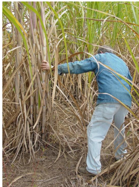
Cane Cutting at field day 07